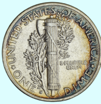
Lot 1: 1945 S Mercury Dime, XF Details