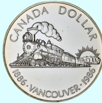
Lot 2: 1986 1 Dollar, Century of Vancouver, Canada, Unc.